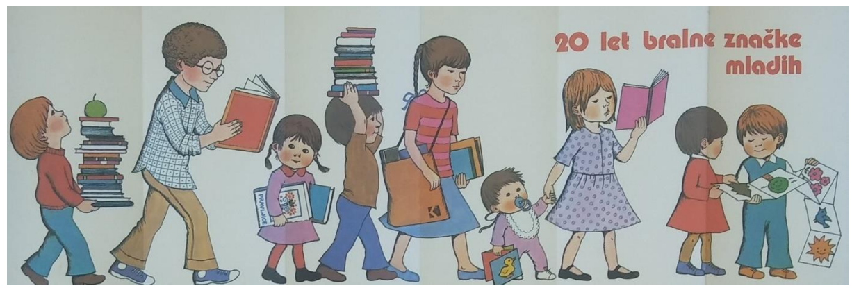
Illustration: Jelka Reichman