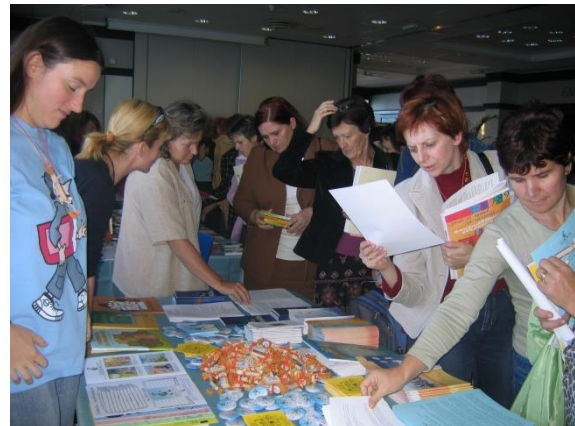
Teachers – mentors educating