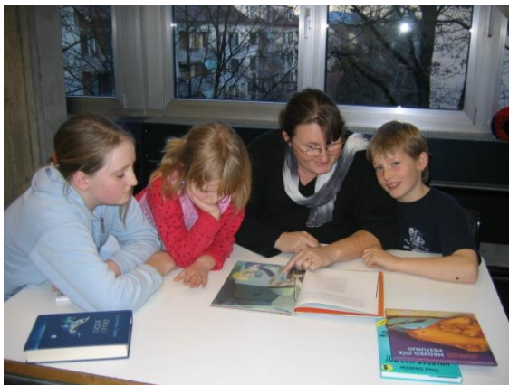
Family Reading (Schwitzerland 2008, archive of BZ)