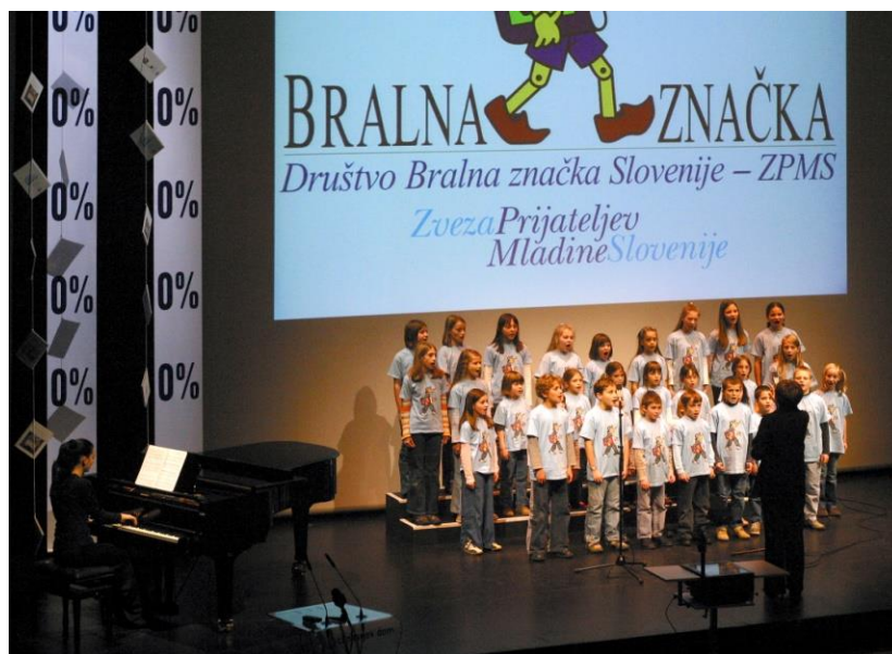
The event marking the 45th anniversary of The Reading badge (I. Lapajne)