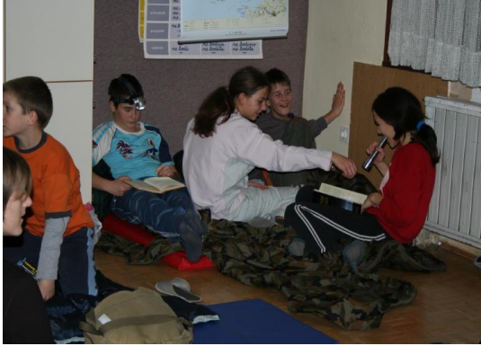
The Reading Night